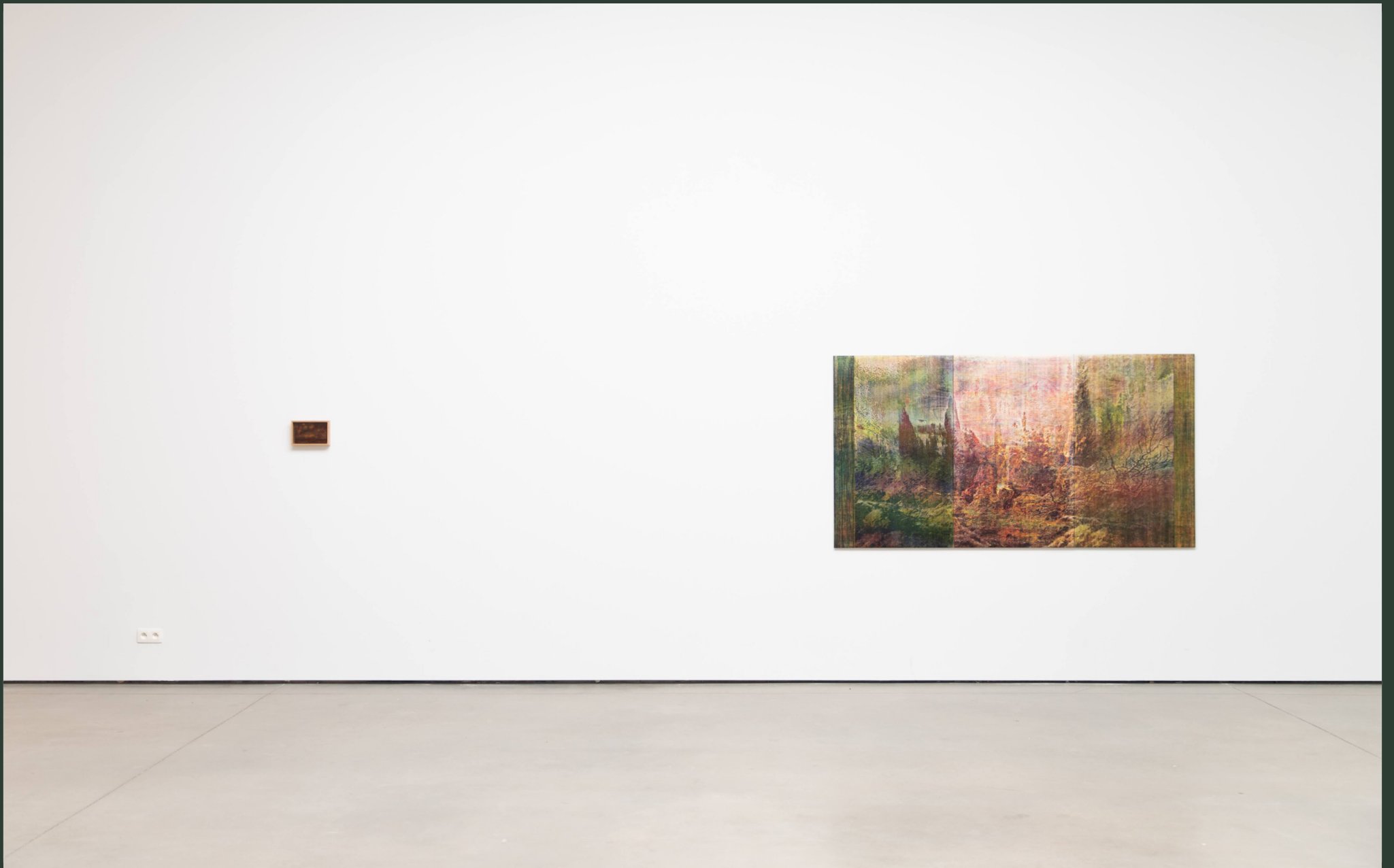
S._A.L.D._5_.I. & There Was Nothing To Fear Nothing to Doubt